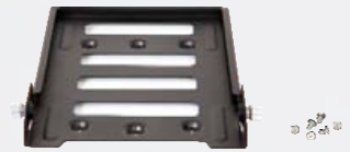
Multi-Functional Installation Bracket BRK17

Optional antenna designed by Hytera is highly recommended. *Outdoor use of RD96X with antenna should avoid thunderstorms.