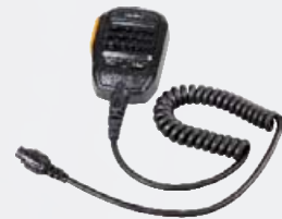
Waterproof Remote Speaker Microphone ( IP67 ) SM18A1

Optional antenna designed by Hytera is highly recommended. *Outdoor use of RD96X with antenna should avoid thunderstorms.