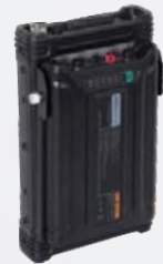
Power Management System PV3001