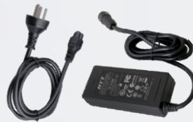
Power Adapter for Portable Repeater PS7502