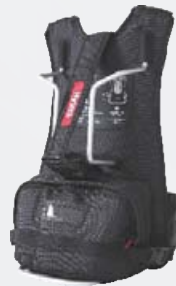
Nylon Backpack (for portable repeater only)(black) NCN010