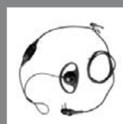
D-earset with in-Line MIC & VOX EHM15