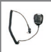
Remote Speaker Microphone SM08M3