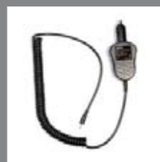
Vehicle Power Adapter CHV09