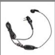
Earbud with in-line PTT & VOX ESM11