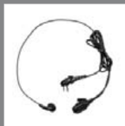
Earbud with on-MIC PTT & VOX ESM12