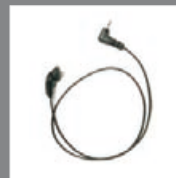
Receive-Only Earpiece with Transparent Acoustic Tube (for use with remote speaker microphone) ESS08