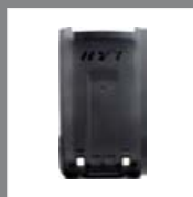
Li-Ion Battery(1300mAh) BL1301