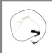
Receive-Only Earbud (for use with remote speaker microphone) ESS07