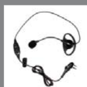
D-earset with Boom Microphone & VOX EHM16